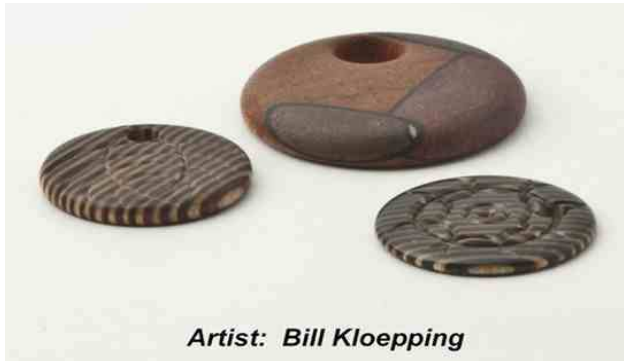
Artist: Bill Klopping

It is impossible to include all of the wonderful show and tell items. This is a sample of what you miss seeing when you don't attend meetings.