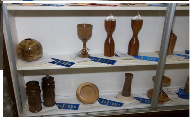
Hunt County Fair Exhibits