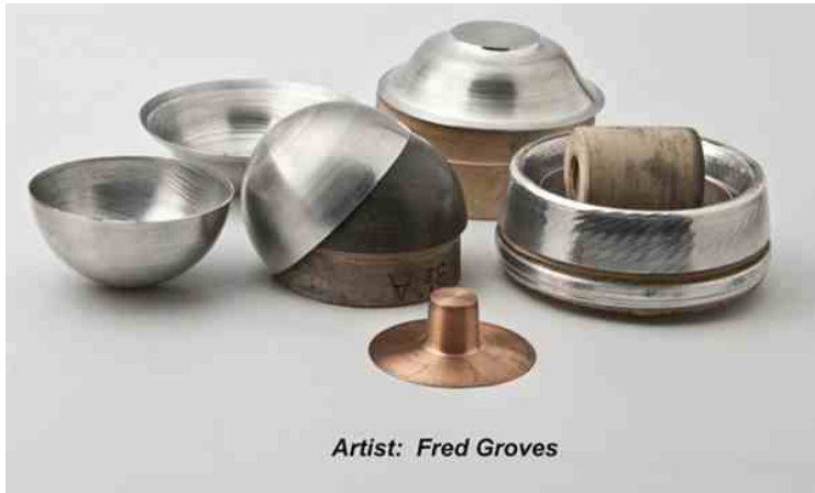
Artist: Fred Groves

You guys are making it harder and harder to select pictures for the newsletter. PLEASE go to the website to view all the wonderful items. It is impossible to include all of the wonderful show and tell items. This is a sample of what you miss seeing when you don't attend meetings.