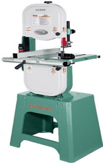
Grizzly G0555 14" Bandsaw