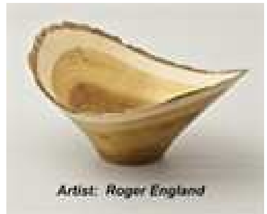
Artist: Roger England