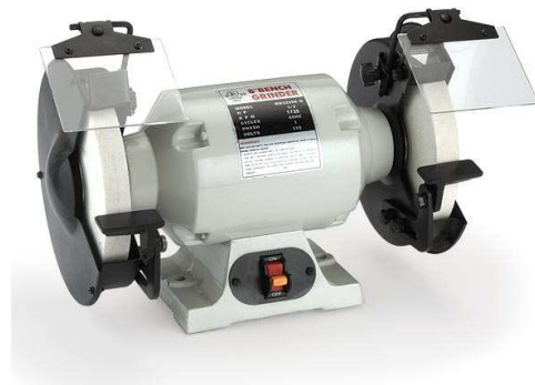
Dual Wheel Grinder