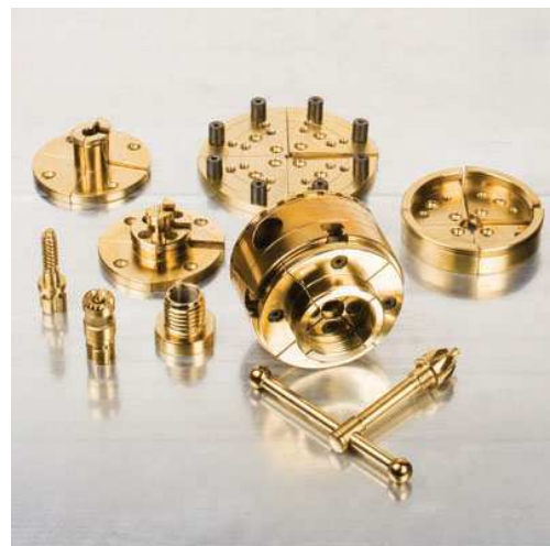
Barracuda Chuck Set