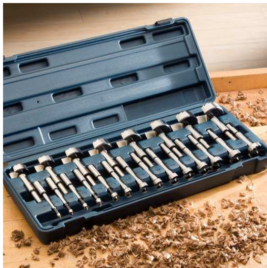
Forstner Bits Set