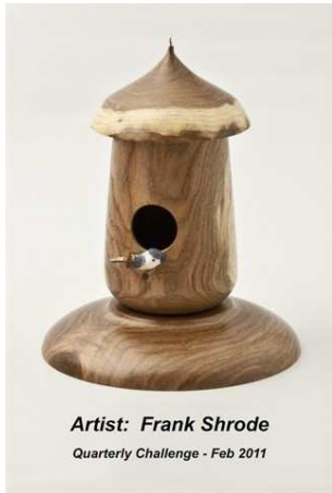
Artist: Frank Shrode Quarterly Challenge - Feb 2011

It is impossible to include all of the wonderful show and tell items. This is a sample of what you miss seeing when you don't attend meetings.