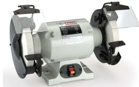
Dual Wheel Grinder